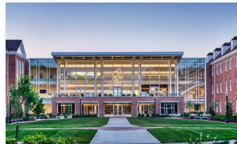
Our Westfield Center headquarters is smart, modern, flexible and collaborative, mirroring the services we offer.

With 150 U.S. employees and more than 300 years of collective years of talent in the specialty market plus the stellar Westfield brand behind each interaction, the Westfield Specialty experience is truly one of a kind.